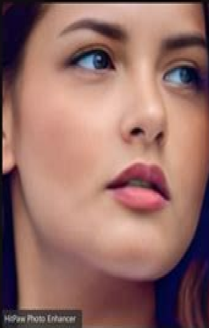
HiPaw Photo Enhancer